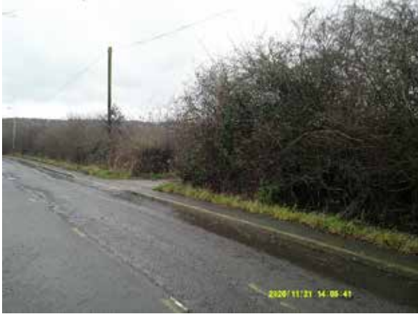
Access point from Newtons Lane